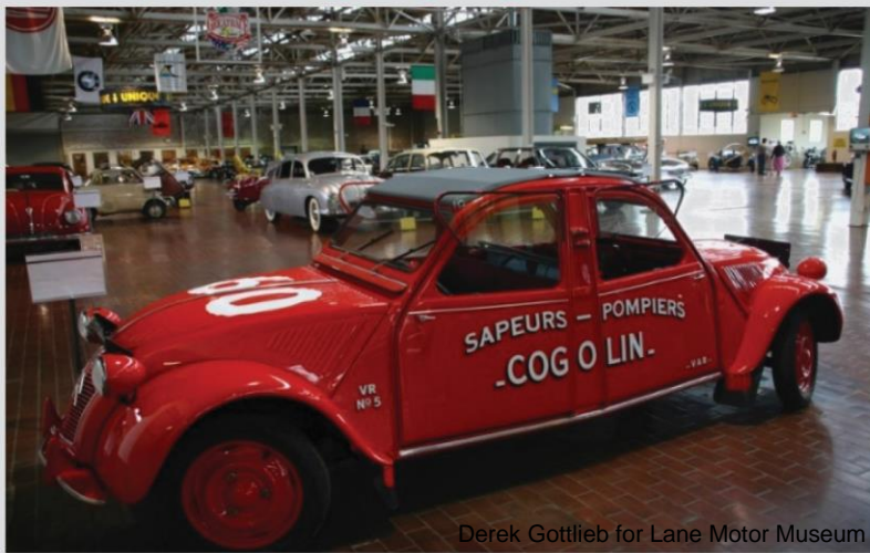
Derek Gottlieb for Lane Motor Museum

The picture above depicts a reproduction of a rather unique solution created in southern France in the early 1950's. The problem: narrow mountain roads and an inability to turn around. The solution: create a car that can be driven from either end. The original car was in-service until the early 1970's. We salute -- and support -- the innovative, can-do spirit of the fire service worldwide!